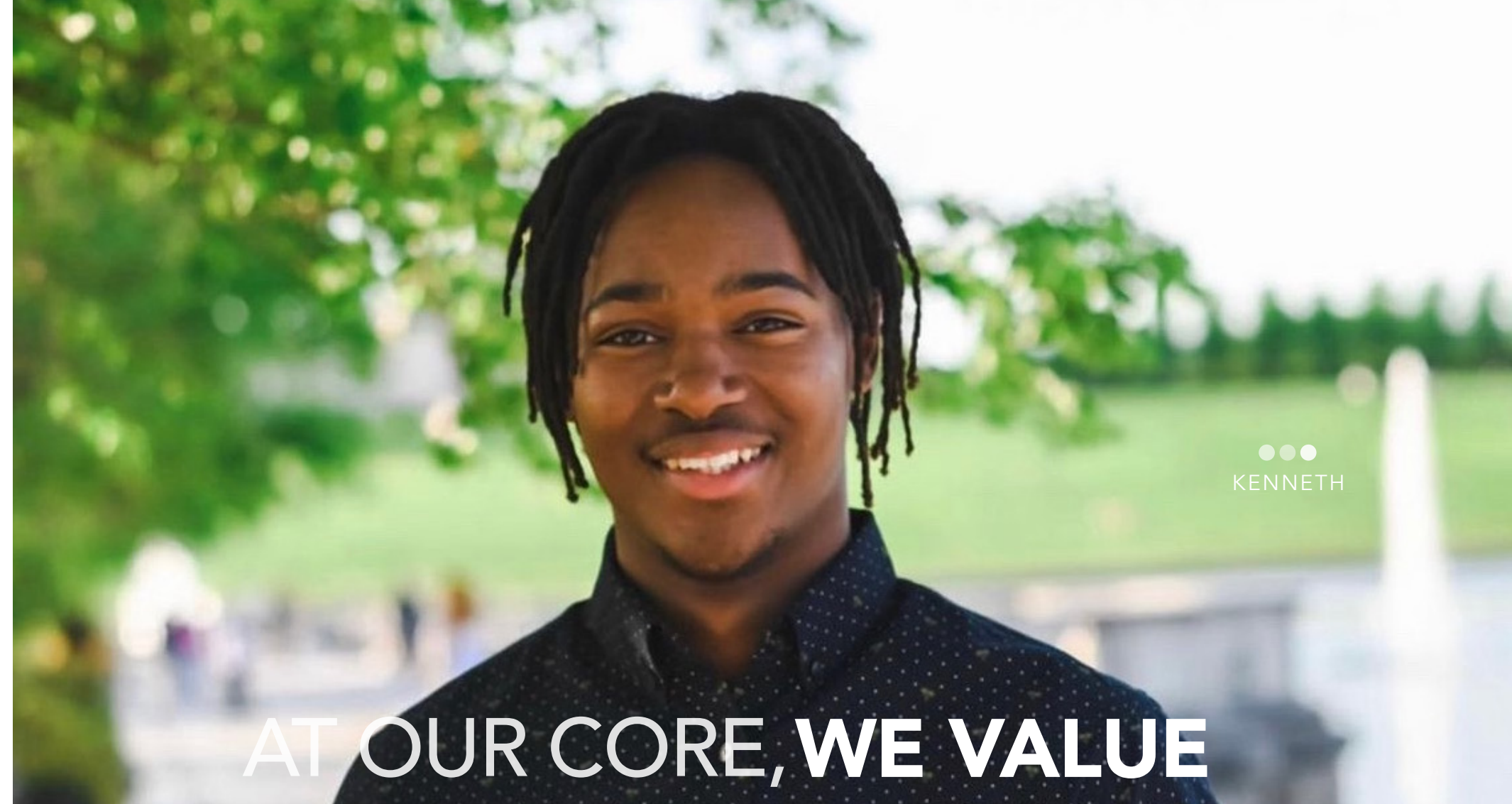
● ● ● ● KENNETH

CB students receiving their degrees will have less debt than the national average for graduates (currently $28,950) and will be on a path to career-relevant employment.