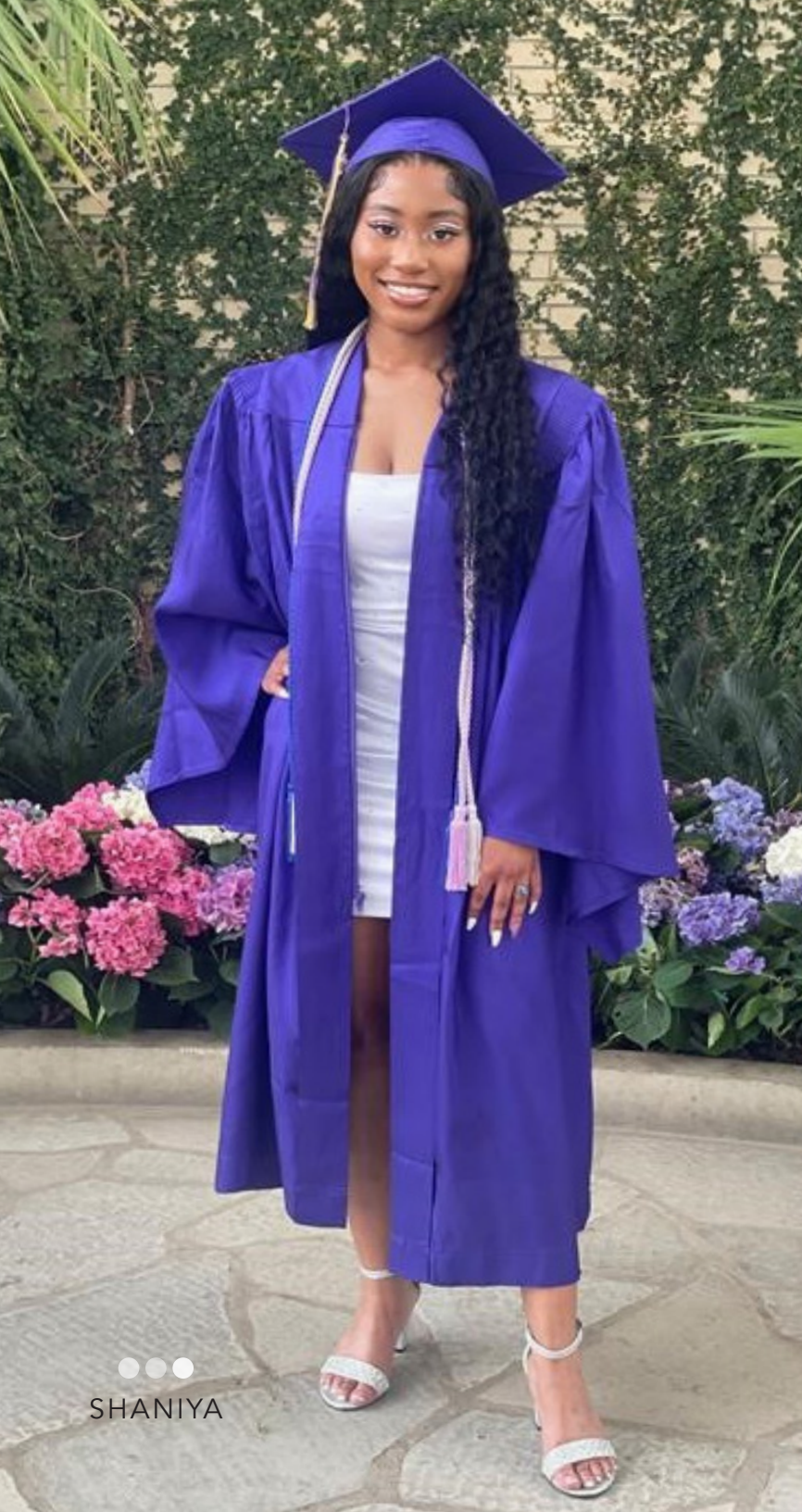
● ● ● ● SHANIYA